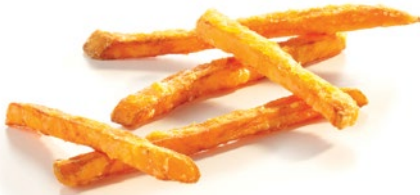
CLEAR COAT 3/8" SWEET POTATO FRIES 56210 36812