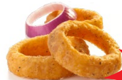
JERSEY SHORE® CRISPY RED ONION RINGS 55776 00052

ALSO AVAILABLE IN CRISPY RED ONION RINGS!