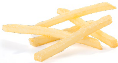
FINE COAT™ 9/32" SHOESTRING 56210 07710