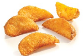
FLAVOURCRISP® TUSCAN HERB WEDGE, 8-CUT - SKIN-ON 56210 05998