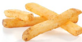
JERSEY SHORE® SEASONED THICK CUT FRIES - SKIN-ON 55776 00050