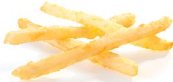
CLEAR COAT 9/32" SHOESTRING 56210 05313