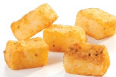
FLAVOURCRISP® TUSCAN HERB SMALL DICED - SKIN-ON 56210 05999