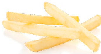
FINE COAT™ 3/8" STRAIGHT CUT 56210 07730