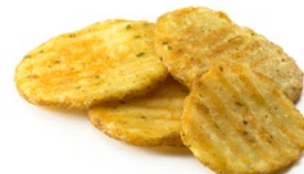
FLAVOURCRISP® TUSCAN HERB CRINKLE MEDALLIONS 56210 35490