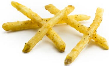
FLAVOURCRISP® SALT & PEPPER EXTRA THIN FRITES - SKIN-ON 56210 05920