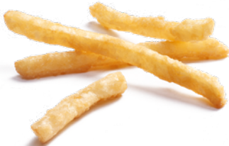
DELIVERCRISP™ 3/8" STRAIGHT CUT 56210 05351

HOW DOES YOUR FRY DELIVER? Ask your sales rep how to take the DeliverCrisp™ Challenge!