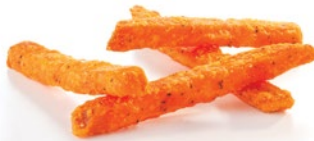
JERSEY SHORE® SEASONED SWEET POTATO FRIES - SKIN-ON 55776 00051