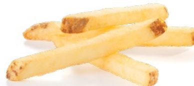
FINE COAT™ 7/16" STRAIGHT CUT - SKIN-ON 56210 07760