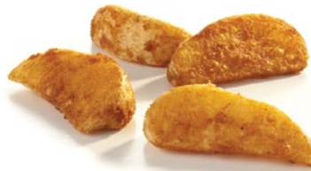
FLAVOURCRISP® 10-CUT SPICY POTATO WEDGE - SKIN-ON 56210 05718