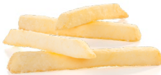
FINE COAT™ 7/16" STRAIGHT CUT 56210 07720