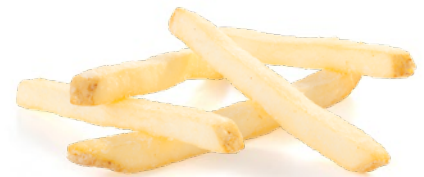
FINE COAT™ 3/8" STRAIGHT CUT - SKIN-ON 56210 07750