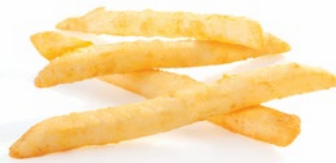
CLEAR COAT 3/8" STRAIGHT CUT 52610 05315