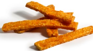
CLEAR COAT 5/16" X 5/8" SWEET POTATO FRIES PLANK CUT FRIES 56210 36820