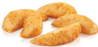
FLAVOUR CRISP® 10-CUT GARLIC & ROSEMARY WEDGE - SKIN-ON 56210 37227