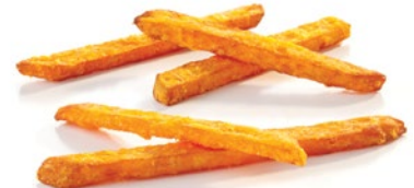
CLEAR COAT SWEET POTATO FRIES SLIM STEAK CUT 56210 36811