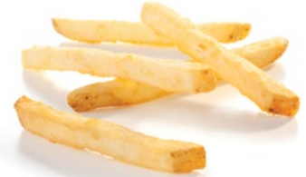
CLEAR COAT 7/16" STRAIGHT CUT - SKIN-ON 56210 05312